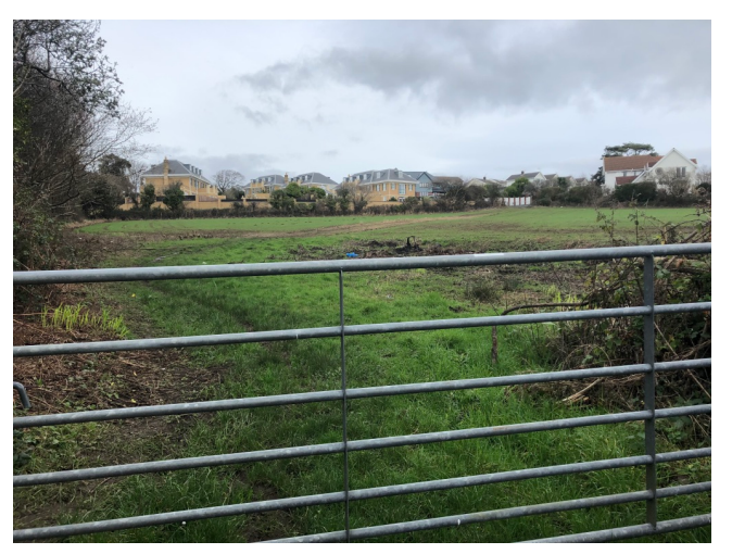
Photograph 4 - The site